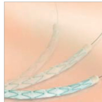
Outstanding flexibility inside the vessel

E-vita open is the only system where a stentgraft with a cuff is loaded in a delivery system. The system allows a one-step intervention by combining classic vascular reconstruction with modern aortic stenting significantly simplifying previous therapeutic procedures.