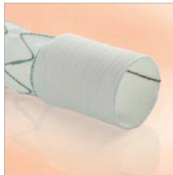
Proximal part of E-vita open with polyester cuff