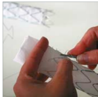
Ultimate precision as well as severest quality control result in highest standards of quality

Prompt availability, ease of use, time saving as well as cost efficiency are clear advantages for the surgeon. The patient benefits from a safe treatment avoiding a second intervention.