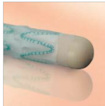
Atraumatic ballpoint tip prevents injuries of the vessel wall