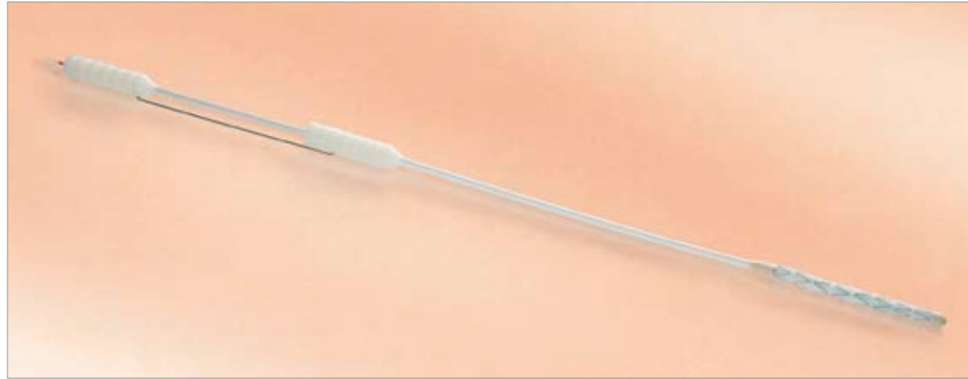
Short and easy E-vita open delivery system with atraumatic ballpoint tip